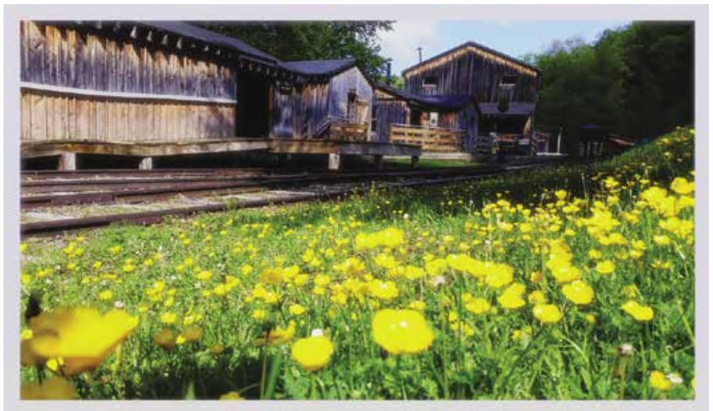
PHF provides easy access through its website to the virtual programs of Trails of History sites such as the Pennsylvania Lumber Museum, which offers a virtual tour, photography exhibits and special events.

Now, a new chapter in the Pennsylvania story is being written. Let us forge ahead with new insight gained from this experience. It is up to each one of us to help preserve and pass on our piece of this narrative.