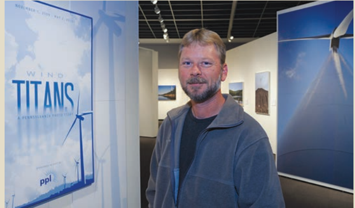
PHMC THE STATE MUSEUM OF PENNSYLVANIA/PHOTO BY BRADY SEITZ