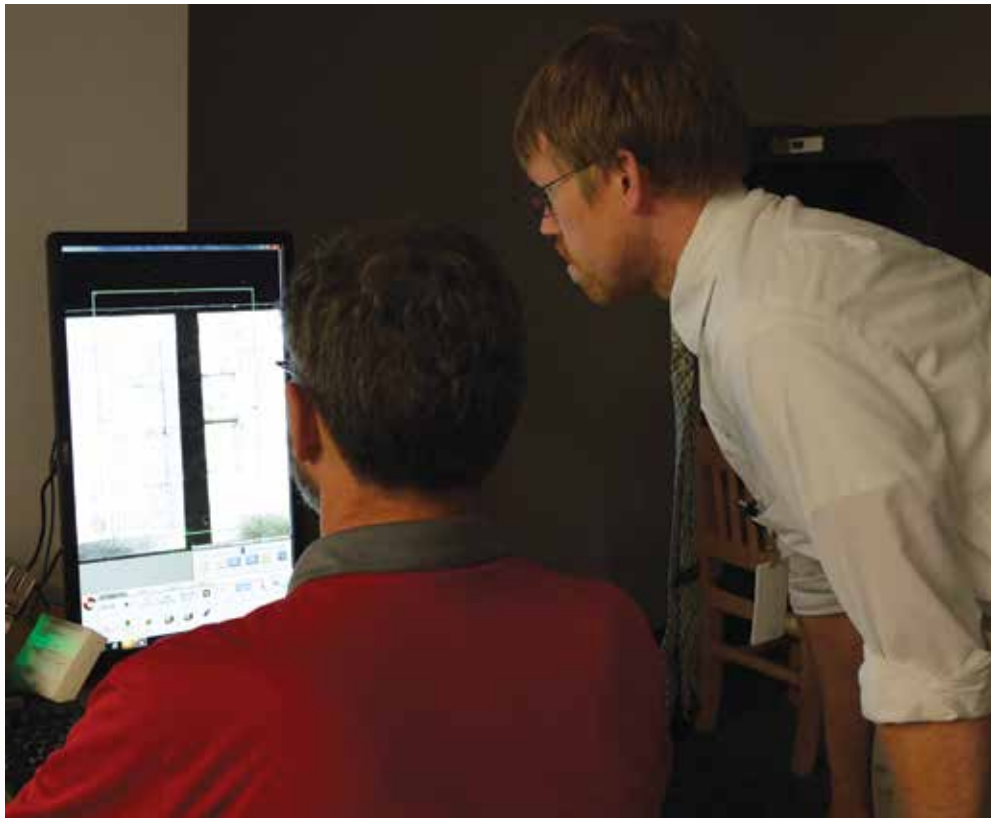
Scholars selected for the SIR program receive support for four weeks of full-time research and assistance from archivists at the Pennsylvania State Archives.