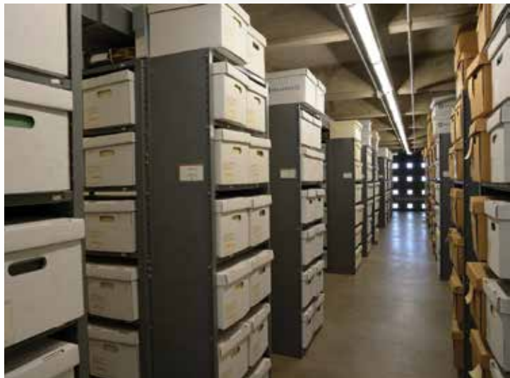
The vast resources of the State Archives are made available for research to scholars in the SIR program. PHMC

Sadly, the number of applicants for the SIR program far outstrips the available funds. The Pennsylvania Heritage Foundation strongly supports the SIR