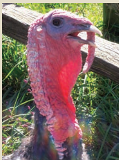
Landis Valley Museum farm resident greets guests at Harvest Days