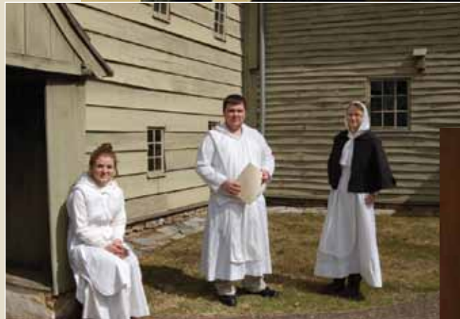
Student Historians at Ephrata Cloister, Charter Day 2013.