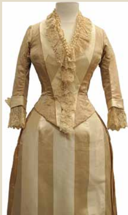
PHMC/LANDIS VALLEY VILLAGE AND FARM MUSEUM

Lancaster, 717-569-0401 www.landisvalleymuseum.org Through February 16, 2014, I Thee Wed: Rural Pennsylvania Wedding Attire, 1830–1930 .