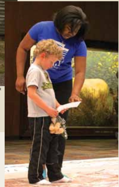
A Harrisburg SciTech High docent on Charter Day at The State Museum.